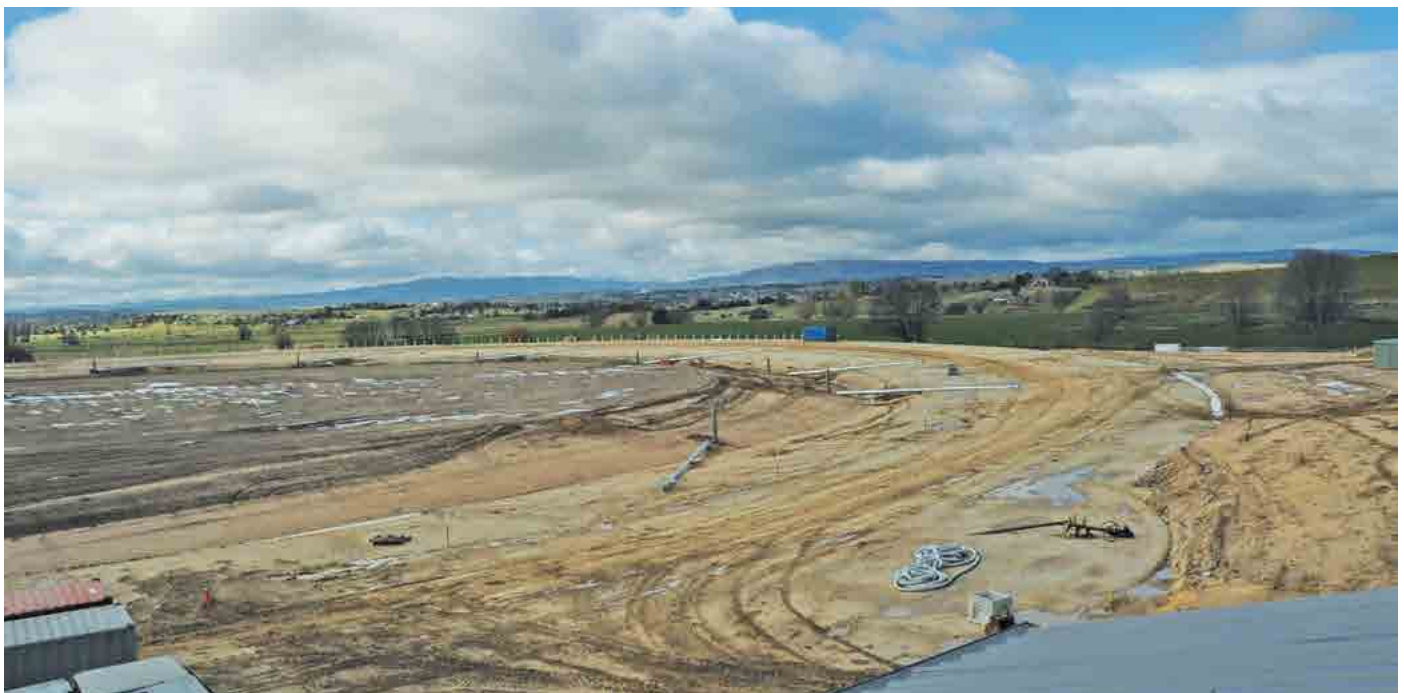
The new Bathurst Harness Racing Track under construction.