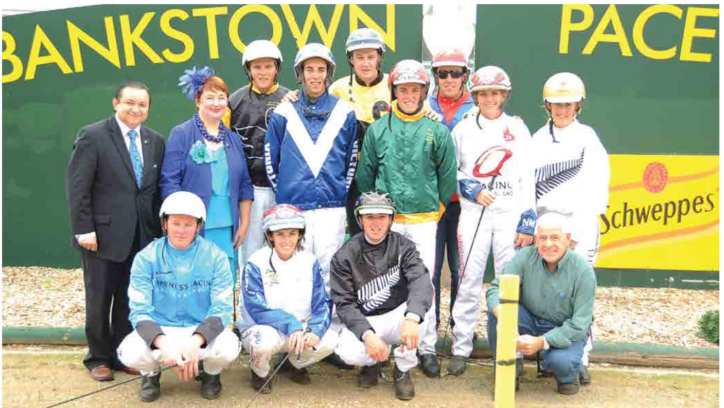
The Australasian Young Drivers Championship representatives at Bankstown Paceway.