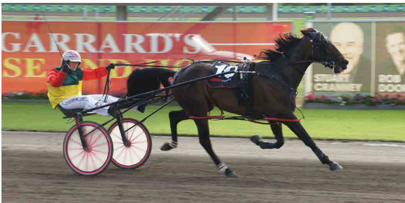
Satellite Ace storms home to win the Group 2 Carnival Stakes on Inter Dominion Final Day.